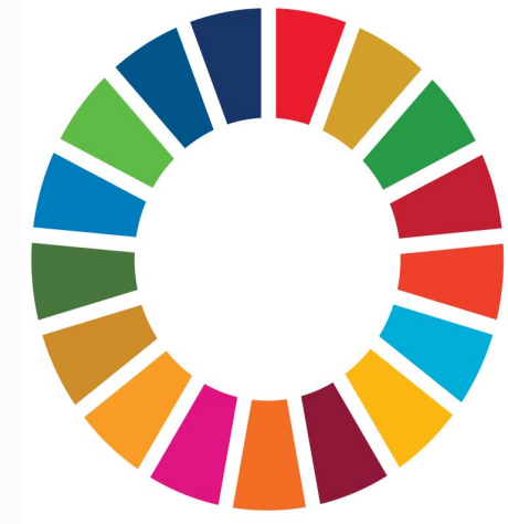
THE GLOBAL GOALS For Sustainable Development